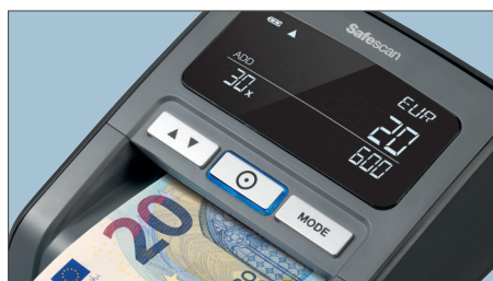
SHOWS VALUE AND TOTAL AMOUNT OF THE SCANNED BANKNOTES