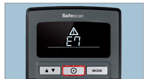
COUNTERFEIT BANKNOTE ALARM