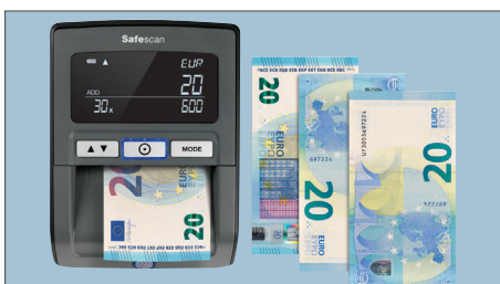
INSERT BANKNOTES IN ANY DIRECTION (EUR, GBP, PLN)